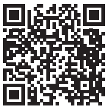
User Guide for Bolts: Recommended Torque

When pulling cables through the access holes, use the Edge Protector to protect the cable from sharp edges.