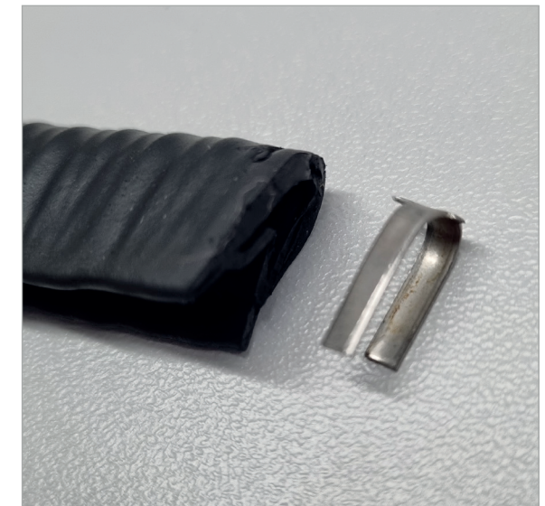
If metal is exposed, remove the outer section with pliers