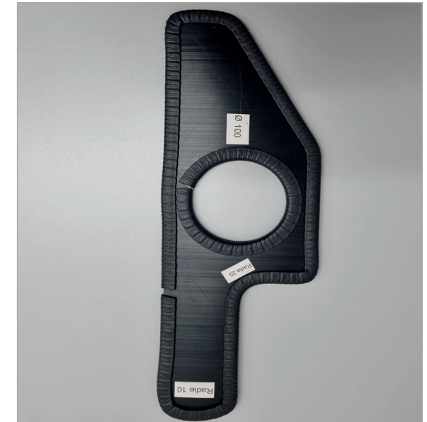
Flexible in concave and convex orientations