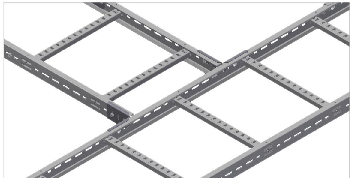
T-Formed by using Hinges on standard Ladders.