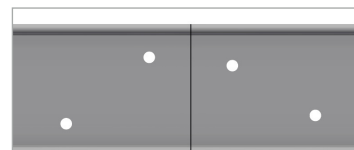
Splice point where old and new product meet (note, differences in perforation location on each side of joint).