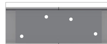
Splice connector in position (perforations on splice plate and tray item are aligned).