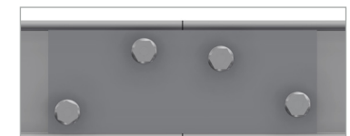
Fully installed splice connector with bolt sets.