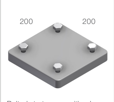
Bolted starters can either be directly fitted to the structure, or fitted to a doubling plate using the M10 bolts supplied.